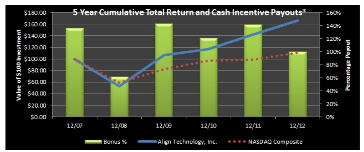
* The above chart assumes $100 invested on 12/31/07 in Align stock and the Nasdaq Composite Index, including reinvestment of dividends.

The Committee believes that the performance objectives established for the financial and key strategic objectives represent meaningful improvements for the organization and, therefore, are reasonably difficult to attain which is in line with our pay-for-performance philosophy. Consistent with this philosophy, the chart below demonstrates that the payout percentages under our cash incentive plan have been higher than target in years when our stock has outperformed the Nasdaq Composite index and below target in years when our stock has underperformed the index.